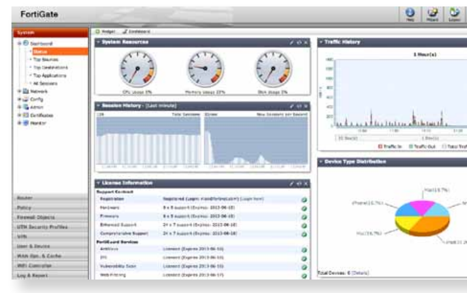
FortiOS Dashboard — Single Pane of Glass Management

Fortinet FortiGuard Subscription Services provide automated, real-time, up-to-date protection against the latest security threats. Our threat research labs are located worldwide, providing 24x7 updates when you most need it.