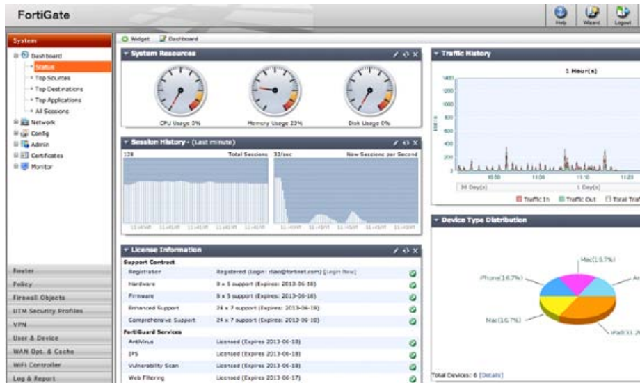
FortiOS Dashboard — Single Pane of Glass Management

Fortinet FortiCare support offerings provide comprehensive global support for all Fortinet products and services. You can rest assured your Fortinet security products are performing optimally and protecting your users, applications, and data around the clock.